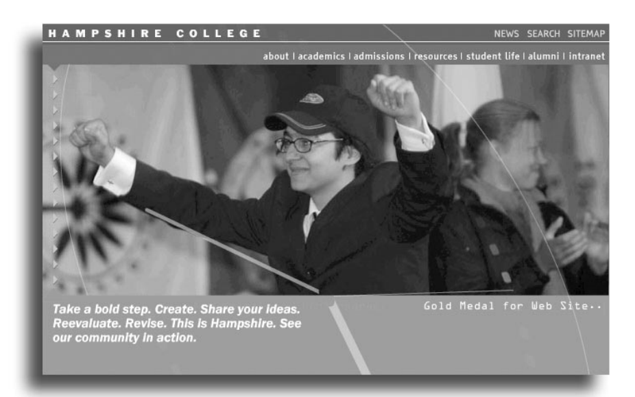
Hampshire College Hampshire College Website electronic media–entire website • gold award

In Hampshire College's website, I find that rare instance when an institution uses fine design as an integral aspect of communication. Here, design neither dominates nor decorates; instead, words, images, sound and movement meld into beautiful, effective ways to impart information and impressions. The graphic and verbal content is substantial and sophisticated. I am also impressed by how the site holds together through its depths. For example, the profiles section contains many treatments—all within a layout system, which results in consistency with variety. The more conventional content sections have a unifying (yet distinct from the profiles section) information architecture scheme. All sections work together within an over-arching design system. Multimedia is appropriate and expressive—not gratuitous. Brilliant work.