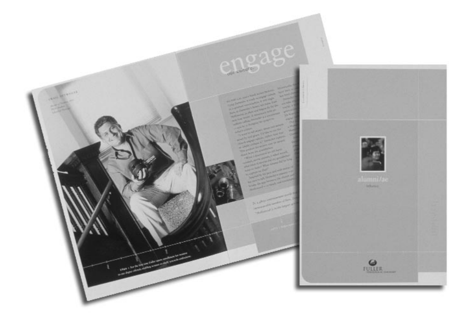
Fuller Theological Seminary Alumni Impact Brochure Series development information/fundraising • gold award

I did not find it easy to pick out a favorite entry, as I had many selections all picked for different reasons. However when push came to shove I chose the Fuller Theological Seminary Brochures. A fine example of design craftsmanship, very well composed, with every detail considered.